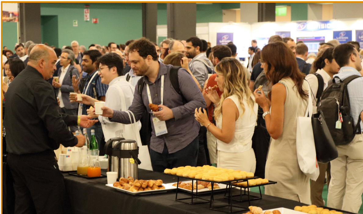
Attendees enjoy some refreshments!